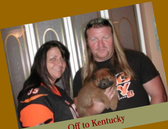
Off to Kentucky