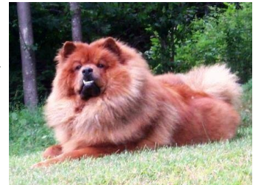
Sequoia looking his most regal!