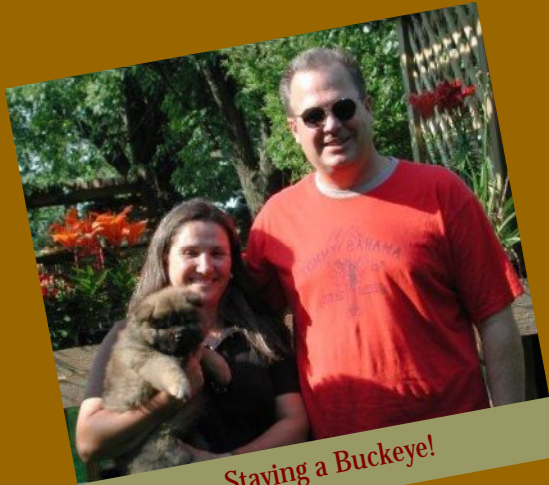
Staying a Buckeye!