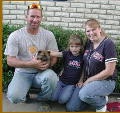
Sarge is staying in Ohio