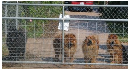
Why can't we come in? We want to play with the chickens!

From left to right, Stormie, Thunder, Shu Ling, and Thor.