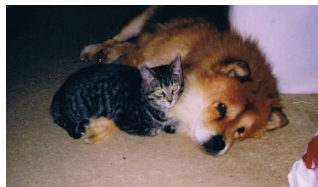
When raised with other animals, Chows adapt just fine.