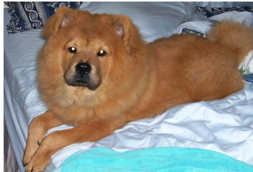
Sure, I'll share the bed.

n't imagine not having her. Mei Ling is from a litter of Gypsy and Buhda.