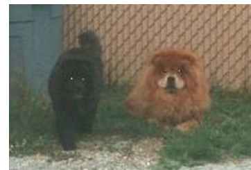
Stormie and Thor

It is so difficult to get a good picture of a black Chow!