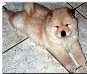
Kaiser Kuma Von Khan of D & M Farm at 8 weeks of

D & M Farm now offers microchipping for your new puppy. The microchip is safely inserted under the skin and can be read by an electronic scanner. Each microchip number becomes part of a national registry. If your puppy were ever lost or stolen, this method of identification could be crucial in finding and identifying your dog. You may also subscribe to a pet recovery service. We use the Avid Microchip. For more info on microchips please visit their website at avidmicrochip.com .