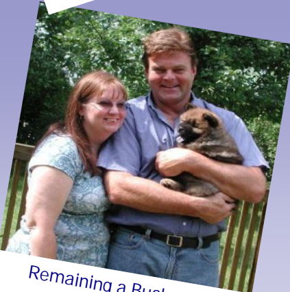
Remaining a Buckeye!

Here are some pictures taken at the time of pickup from our latest litters.