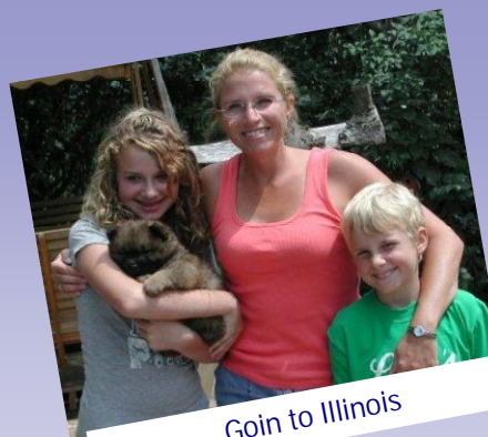
Goin to Illinois