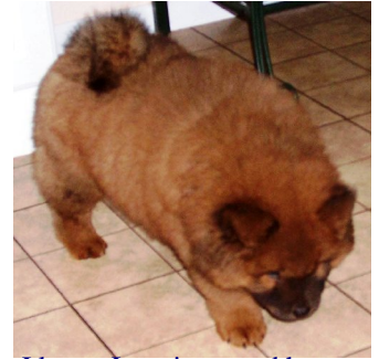
I know I put it around here somewhere.

Sassy is a puppy from Kaiser and Sheba's May 2007 litter.