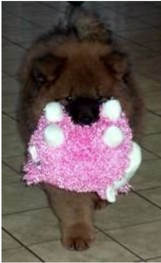
Mine, all mine!

Sassy is now settling into her new home in Mountain Home, Idaho. She is doing great with housetraining and loves all her new toys and attention she is getting. Her pet companions include a Llasa Apso and a Shitzu that she is giving a run for their money. They are both 13 years old and having a youngster around is bit overwhelming.