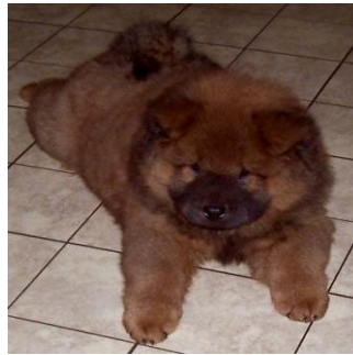
Sassy in her new home.

She is referred to as a "precious bundle of joy!"