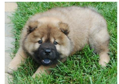
"I'm gonna get ya!"