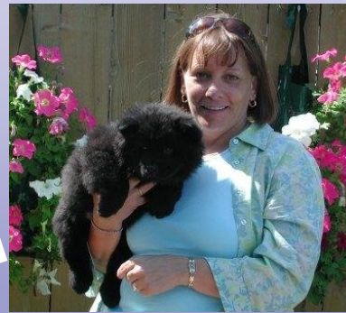
Off to Las Vegas!

Here are some pictures taken at the time of pickup from our latest litters.