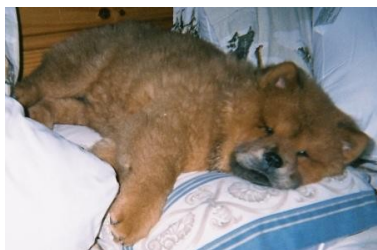
Is breakfast ready?