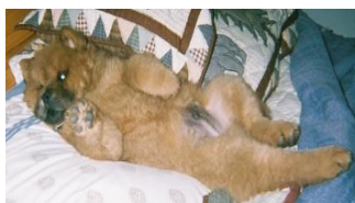
Can you pull the blanket up please?

Rusty believes they belong in our fire pit along with our TV remote so we don't have to look too far. Everything he takes off with, ends up in the fire pit. We thank you both for all you do for your chows, your home for them is great. Rusty and Shadow are our babies and what a wonderful pair to come home to. Thanks!