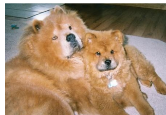
Shadow & Rusty