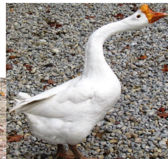
Oscar, Chinese Goose