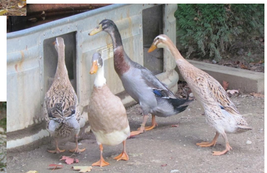
Indian Runner Ducks