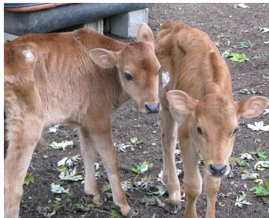
Jethro & Bessie

sey calves. Jethro is our bull calf and Bessie is our heifer calf. Bessie will one day be our milk cow and Jethro will probably end up in our freezer. I have always said that I will never eat anything I have been personally ac-