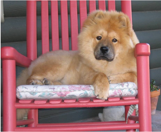
Hanging out in the rocker.