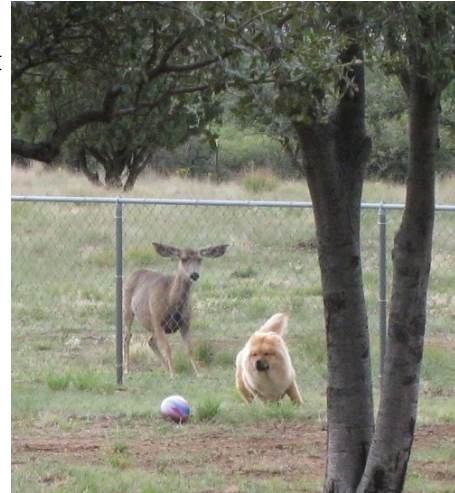
I've got it!