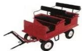
Pony cart, but ours will be green.