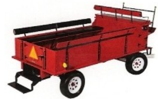
Our wagon except ours will be green.