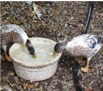
Coping with the heat.

Our trip to the Mt. Hope Carriage Auction was successful once again! We were able to find a horse carriage that will meet our needs for participating in parades. Fortunately for us, we were able to get a used one at auction rather than paying for a new one. We are anxious to get started.