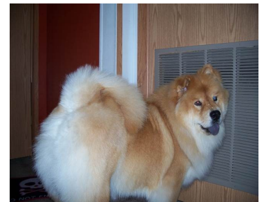
Looking for the cool air!

Fresh water and clean food are a must. Some dogs like to have ice cubes put in their water to keep it cool. Make sure ants and other pests do not invade your pet's food. There are bowls made specifically to help prevent this.