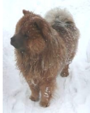
Kai is a puppy from Ceasar & Ginger.