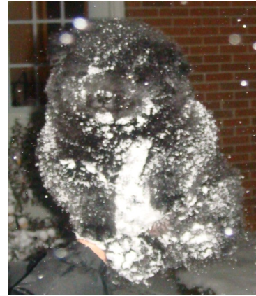
Black puppies can't hide in the snow!