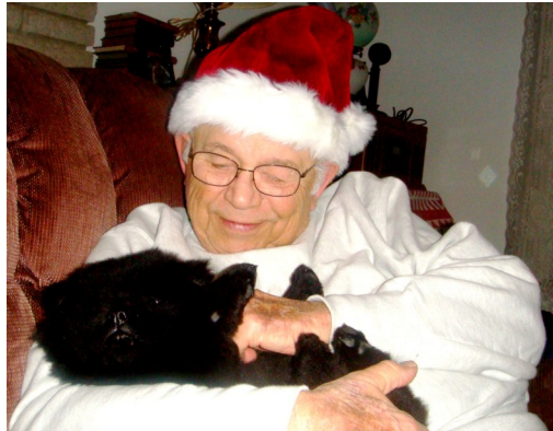
Snuggles with Grandpa.