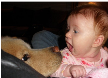
Where's my pacifier you rotten puff-ball?