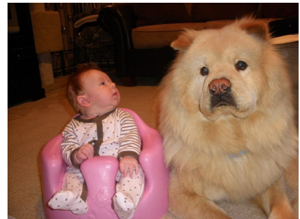
Quit hogging the camera!