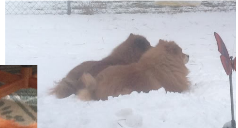
Ginger is from Sheba & Kaiser and Sassy is from Misty & Sampson.

Misty and Sheba were sisters and live together today in a home in Pennsylvania.