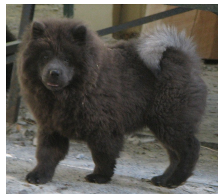
Bluebelle, our newest member.