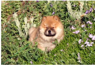
Which one is the flower?