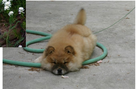
I wasn't chewing on it!

"Heat can be deadly to overactive or dark coated Chows!"