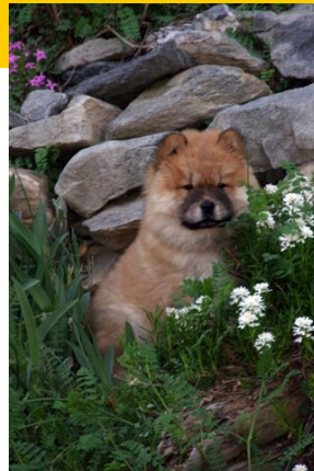
Can you see me?