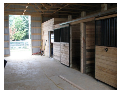
Inside the horse barn.

We are always busy around the farm and we love it. But, we are never too busy for visitors and would love for you to come!