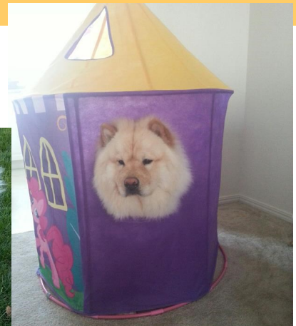
I'm supposed to do what with my hair?

"Mega-esophagus is something many animals can get. If you know the symptoms and diagnose early, you can manage the disease."