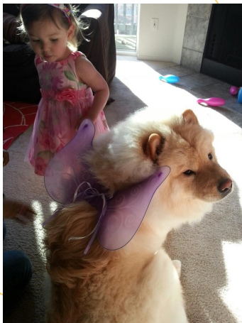
This is NOT for public consumption!